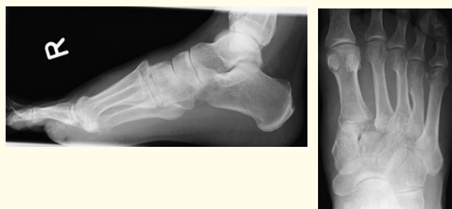
Figure 3: XR left foot: lateral view with prominence in the TMT joint line. AP with fracture dislocation of the 1 st and 2 nd ray.

CT-scans were conducted that found some extensive bone injuries to the cuboids, dislocation of the second metatarsal bone. The base of the second metatarsal bone had some destruction of the joint facet with approximately 50% involvement.