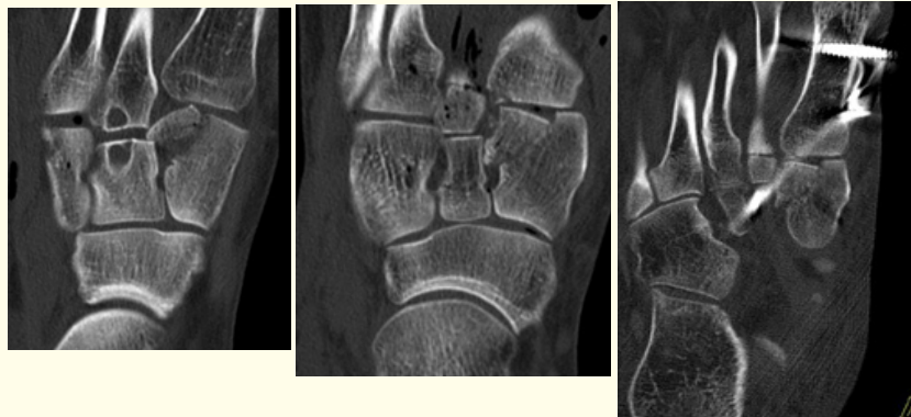
Figure 5: CT scan with complex fracture dislocation of the cuneiforme I. Initial and temporary retention achieved in external fixator and extraarticular screw.

A 54-year old chef sustained a motorbike accident. He came off his motorbike and was catapulted into a ditch where he impacted the ground with his feet first. He sustained multiple fractures including an open tibia fracture, a fracture to the femur and wrist as well as an open fracture dislocation of his TMT joint. The diagnosis was made under Image Intensifier in theatre during the process of applying the external fixator. All injuries occurred on the same side. He underwent a second stage reduction and fixation of his Lisfranc injury, which included K-wiring. The K-wires were removed some 12 weeks after surgery.