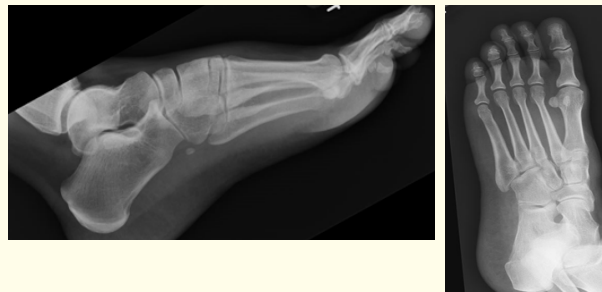
Figure 1: XR left foot: Widening of the 2 nd and 3 rd ray.

A 39-year-old woman crossed the dance floor in high heels. She missed a step and twisted her ankle into supination. She felt immediate pain in her foot and was unable to bear weight afterwards. The following day, she presented in A and E where swelling was documented that included the whole foot. X-rays and CT scans were conducted. The standard X-rays raised suspicion due to a widening between the second and third ray. CT scans revealed fractures to the cuneiforms.