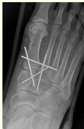
Figure 6: K-wire fixation leading to anatomical reduction. The wires were removed later.

37 months after injury, the patient continues complaining of symptoms in his foot. He experiences difficulties when he walks or climbs stairs. At home, he is able to climb stairs without difficulties, which is mainly due to his installed grab rail. However, without a rail, he can only take one step at a time. His comfortable walking distance is 1 mile but he walks with a limp. He feels insecure when he stands and turns bearing weight on his right foot or when he changes directions. He can't stand for more than 1 hour. He has no trust bearing full weight on his foot, for example, when he lifts a bucket of water or a heavy tray. Also, he finds it difficult to balance heavier items, e.g. potatoes or a sack or rice, which are loose and prone to move around. It causes severe discomfort in his right foot. Also, he does not tolerate security boots and only wears trainers or sandals. He feels insecure walking on uneven ground as he may lose his balance. He walks more easily on flat surfaces.