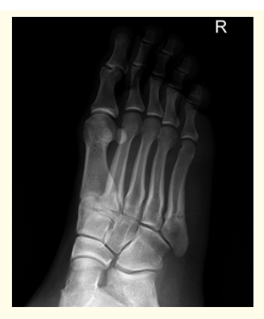
Figure 1: Jones Fracture.

regarding how such fractures should be addressed. A Jones fractures is a transverse fracture at the metaphyseal-diaphyseal junction which Sir Robert Jones specifically classified as being 'the proximal <sup>3</sup>/<sub>4</sub> segment of the shaft distal to the styloid [1,2]. A Jones fracture is usually caused by forceful ankle plantarflexion and forefoot adduction, leading to excessive force being placed on the lateral boarder of the forefoot and metatarsal heads [3,4]. This unique type of fracture includes the articulation of the fourth and fifth metatarsals [5] and is known for its tendency to have delayed healing time. This in turn can result in non-unions and treatment difficulties for clinicians [2, 6-9].