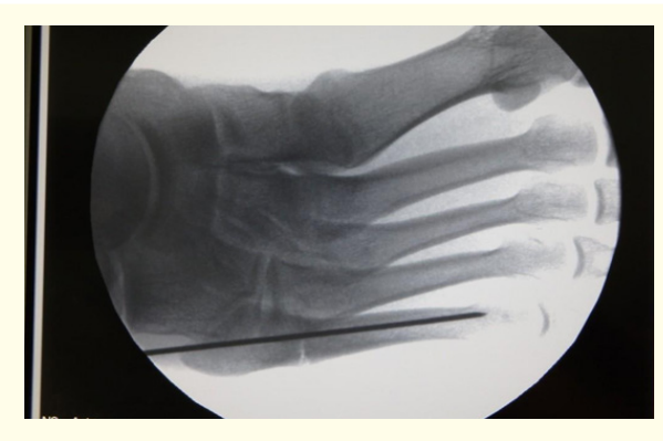
Figure 5: Fluoroscopic image of the guidewire advanced into the 5<sup>th</sup> metatarsal.

The wire was confirmed to be in the metatarsal on both AP and lateral views on fluoroscopy.