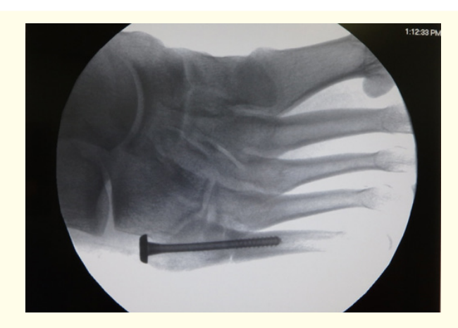
Figure 9: Fixation and screw placement confirmation obtained under fluoroscan control.

A 50 mm x 4 mm cannulated screw and washer was then selected. Under power the screw was inserted into the metatarsal and the fracture was noted to compress. Good fixation was obtained. An injection with local anaesthetic and steroid was administered with a 10 ml syringe spinal needle. The wounds were closed with using a single Nylon stitch.