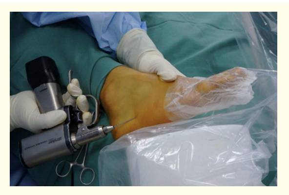
Figure 4: Smooth guidewire being introduced into the metatarsal styloid and advancement down the barrel of the 5<sup>th</sup> metatarsal.

Under Fluoroscan control a wire was introduced into the styloid of the 5<sup>th</sup> metatarsal. A percutaneous arthrotomy was performed at the 5<sup>th</sup> TMT joint. A smooth guide wire was introduced into the metatarsal styloid and passed down the barrel of the 5<sup>th</sup> metatarsal.