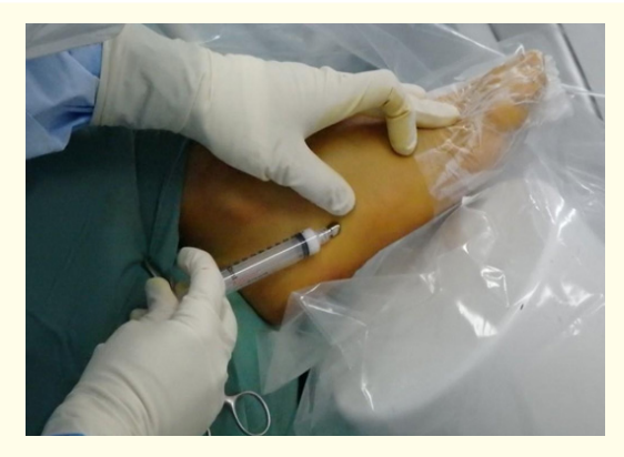
Figure 7: Injection of Synthetic Bone Graft down the canal of the 5<sup>th</sup> metatarsal.

Under power, a 50mm x 4mm cannulated screw was inserted into the metatarsal and the fracture was noted to close.