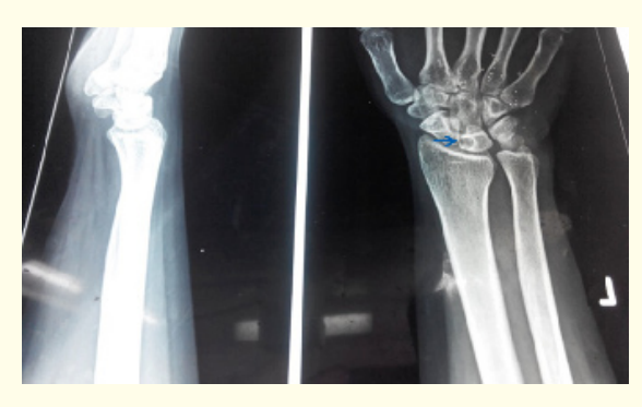
Figure 1: AP and Lateral view radiographs of the left wrist.

Computed tomography scans of the wrist revealed round hypointense cystic lesion in the centre of the lunate bone measuring 5.3 \times 4.7 \text{ mm} in diameter.