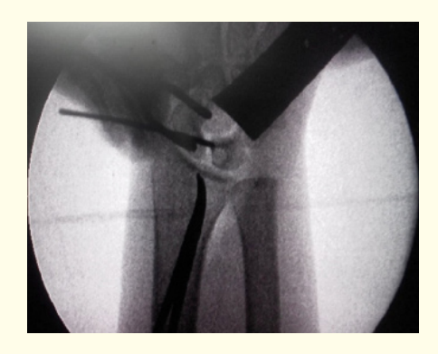
Figure 6: shows K wire placed intraoperatively to identify the site to make the cortical window over the cyst.

A volar approach was taken<sup>2</sup>. A 6cm longitudinal incision taken centered over lunate bone and extended proximally. This was done to include the distal metaphyseal portion of radius from which a cancellous bone graft was planned to be taken.