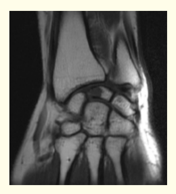
Figure 5: T1 weighted image showing hyperintense lesion in the lunate bone consistent with a cyst.

A volar approach was taken<sup>2</sup>. A 6cm longitudinal incision taken centered over lunate bone and extended proximally. This was done to include the distal metaphyseal portion of radius from which a cancellous bone graft was planned to be taken.