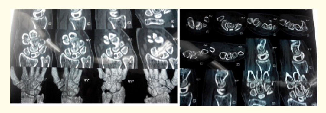
Figures 2&3: Computed Tomography images of the wrist showing the cyst.

Computed tomography scans of the wrist revealed round hypointense cystic lesion in the centre of the lunate bone measuring 5.3 \times 4.7 \text{ mm} in diameter.