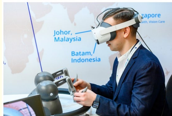
Figure 4: Latest technology presented at Ophthalmic Hub 2023 (like this virtual reality training tool).