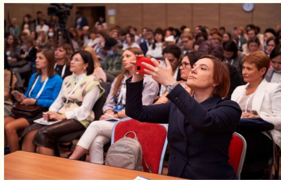
Figure 5: Packed conference room at Ophthalmic Hub in Kyiv 2023.

Traditionally, the OphthalmicHub brings specialists and business together to discuss modern technology as well as urgent problems facing Ukrainian ophthalmology.