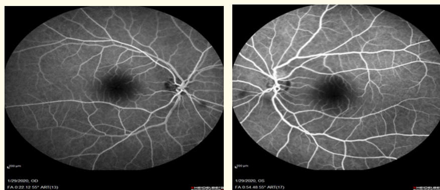
Figure 2: Fundus fluorescein angiography of both eyes.