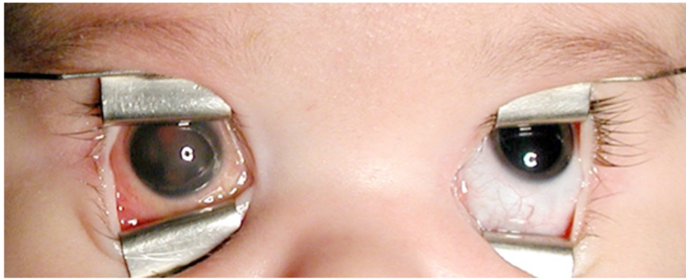
Figure 3: External photograph shows an 11 month-old child with bilateral retinoblastoma and unilateral phthisis bulbi at presentation. Due to the inflammatory signs, epiphora and mucous discharge, this child was initially diagnosed with unilateral conjunctivitis and had been followed for 2 months by a pediatrician.

[14,25,26]. The age of diagnosis can vary from 2 to 72 months, and such cases may be unilateral or bilateral [26,29] with a high prevalence of bilateral cases [29,30]. The diagnosis may be more challenging in unilateral cases because frequently the intraocular tumor is unidentifiable. However, in bilateral retinoblastoma, the tumor in the contralateral eye provides the necessary information. This form of presentation is usually associated with advanced intraocular disease [26,29]. The association of phthisis bulbi and buphthalmos in the contralateral eye of a child with bilateral retinoblastoma has been described in the literature [31].