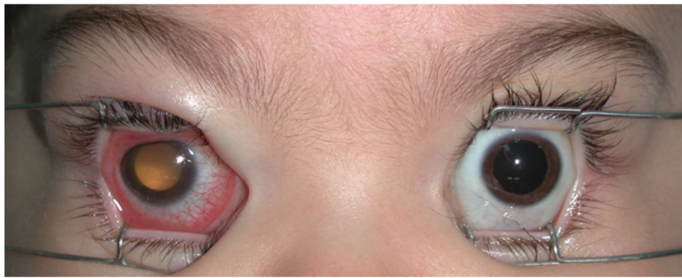
Figure 2: External photograph shows a 20 month-old child with unilateral retinoblastoma and signs of orbital cellulitis that include eyelid swelling and hyperemia; conjunctival hyperemia and chemosis presentation; and pain. There is an associated xanthocoria that is evident when the pupil is dilated.

It is also very uncommon to see retinoblastoma presenting as orbital cellulitis (Figure 2). However, some series showed that it may be the case in up to 15 % of all clinical presentations [25]. The pathogenesis surrounding the development of cellulitis is unknown but possible explanations include immune response, generated by a contralateral affected eye or by necrotic tumor byproducts. Interestingly, bacteria does not seem to be implicated [26].