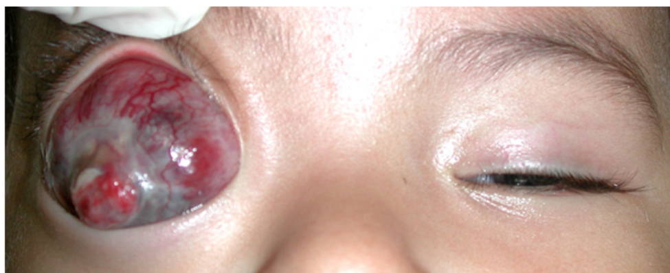
Figure 1: External photograph shows a 24 month-old child with advanced unilateral retinoblastoma (right eye) that included extraocular tumor extension, proptosis and orbital invasion.

Proptosis is the most characteristic clinical sign in this presentation [23] but leukocoria has also been described as the first presenting sign of orbital retinoblastoma [18,24]. Orbital retinoblastoma is typically a late presentation with an average age at diagnosis between 18 and 38 months (Figure 1). Although silent proptosis is the most frequently presenting sign, other possible clinical presentations include proptosis with inflammation (orbital cellulitis), palpable orbital mass, eyelid swelling and an exuberant fungating orbital mass [19].