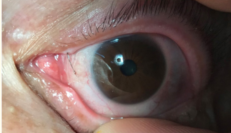
Figure 2 and 3: The remaining eyelash after the eyewash.