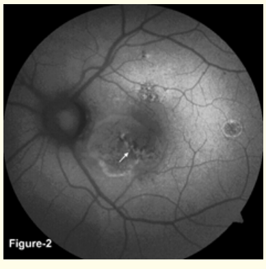
Figure 2: Fundus autofluorescence, OS. Choroid rupture is seen as crescent-shaped streak and hyperfluorescent on autofluorescence imaging (arrow).

Figure 1: Colour fundus photo, OS. Pigment epithelial detachment (long arrow) is seen in the infero-temporal to the optic nerve and the second one (short arrow) is smaller and is located in the temporal side of the macula.