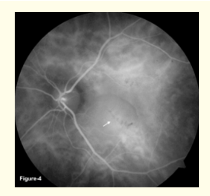
Figure 4: ICGA early phase, OS. Crescent shaped, hypocyanescent rupture site (arrow) and there is hypercyanescent area around the rupture.