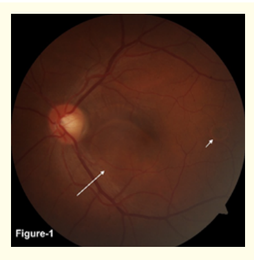
Figure 1: Colour fundus photo, OS. Pigment epithelial detachment (long arrow) is seen in the infero-temporal to the optic nerve and the second one (short arrow) is smaller and is located in the temporal side of the macula.