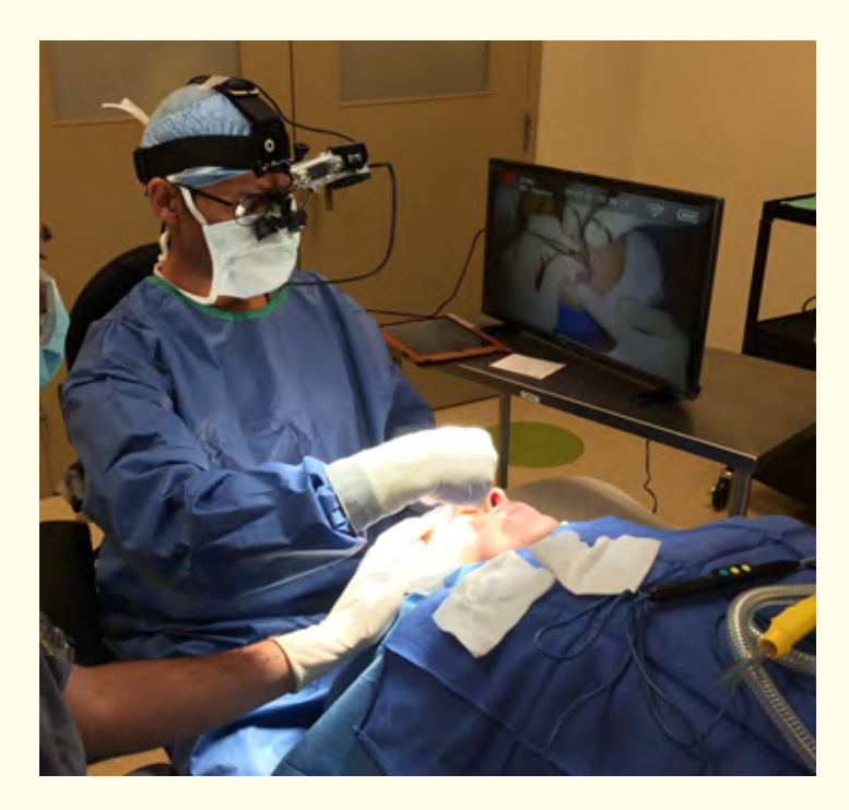
Figure 1: The surgical set-up showing the surgeon (KP) wearing the head-mounted camera.

The camera functions were controlled remotely by an assistant with the use of the GoPro App on a tablet computer to ensure proper framing of the video recording.