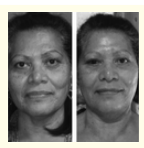
Figure 3: Baseline and 3-month postoperative appearance of lower lids (Patient consent obtained).

Figure 2: Baseline and 1-month postoperative appearance of lower lids (Patient consent obtained).