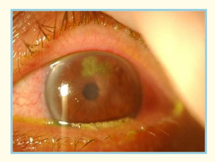
Figures 2: Herpetic corneal infection: Time 0 and 5 days later Rhux Toxicodendron 15CH granules.

alternative or supplement to topical antibiotic therapy (frequently extended for lengthy periods), the single-dose eye drops HOMEOPTIC can be used, at a dosage of: 1- 2 drops in each eye 2-6 times a day, ARGENTUN NITRICUM 7CH tube of granules, 5 granules 2 times a day for 15 days (pediatric homeopathy) or SILICEA 9-15 CH , when more extensive problems of rhino-sinus infection are present. Homeoptic is a homeopathic eye drops made from Euphrasia officinalis 3DH, Calendula officinalis 3DH and Magnesia carbonica 5CH, which are especially effective on inflammations with sharp pain, copious tearing and reddening of the eyes [36,50]. Argentum nitriticum is a homeopathic medicine made from silver nitrate and generally used in case of excretions [36,56], while Silica is made from colloidal anhydrous silica and it is generally used in pediatric age [36,57]. At the end, it should be remembered that antibiotic therapy below one year of age means opening the way for allergy later in the child's life.