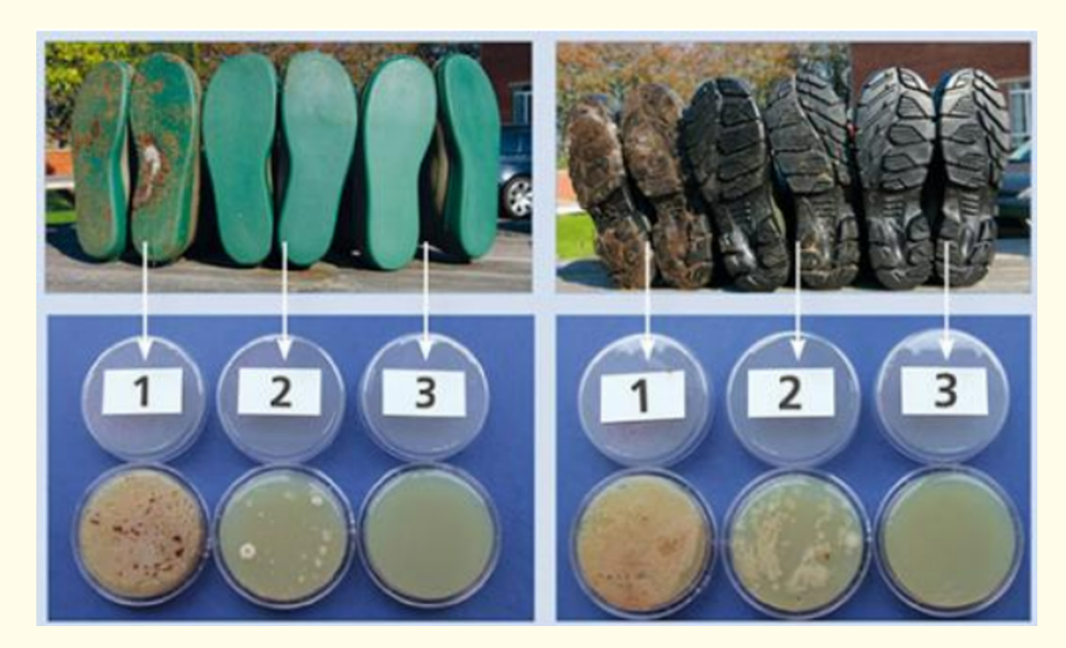
Figure 1: 1- dirty boots 2- rinsed with water 3- disinfected.

The study stressed the need for regular replenishment of footbath disinfectants and also indicated to the impact that organic matter can have on the disinfectant's ability. However, this is not the only illness that can be walked on the farm. Salmonella , coccidial oocysts and most of the important diseases can use the humble wellington boot as a form of transport. Yet footbaths have almost overlooked in terms of quality assurance.