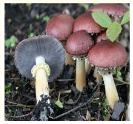
Figure 1: Mushrooms.