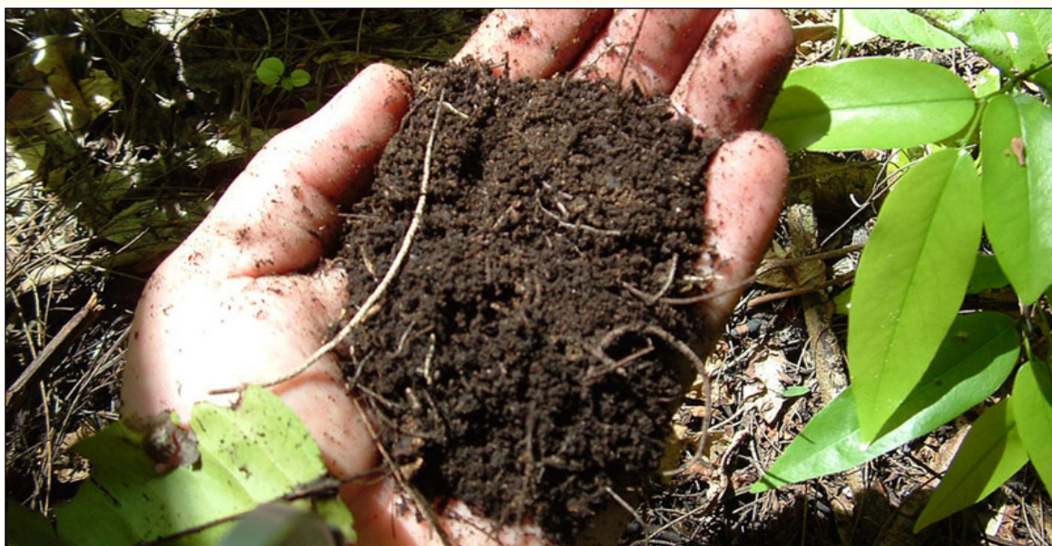
Figure 1: The soil an aggregate of minerals containing toxic and essential elements.

Good nutrition is one of the keys to a healthy life. That is a fact because one needs good food for a healthy development. It is said that one can improve his/her health by keeping a balanced diet. But keeping a balance diet is not easy as technically food portions that make a meal cannot be said to be balance in terms of the essential elements that the body needs for its physiological and biological functions. The vision of nutritionists and dieticians are that people should eat foods that contain vitamins and minerals. This includes fruits, vegetables, whole grains, dairy, and the foods containing proteins. These foods mentioned have the source as the earth (Figure 1 and 2).