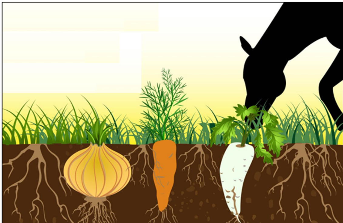
Figure 2: Vegetables directly from the soils and Daily products from animals but depend on plants for their wellbeing.