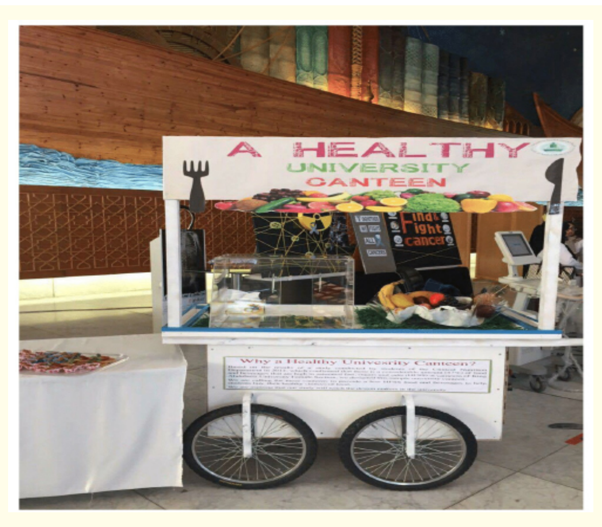
Figure 2: A Sample Healthy School Canteen (SHSC).