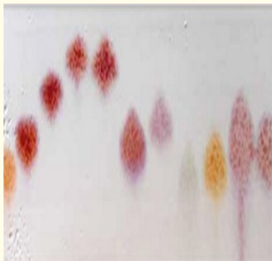
Figure 2: Formation of color by amino acids using two reagents (2-hydroxy-benzene-carbaldehyde and 4-bromobenzeneecab aldehyde as shown by [19]).

In this study, we proposed the modified spray reagent that contains stannus chloride ( \text{SnCl}_2 ) for rapid and easy identification. Thus, our result illustrated in Figure 3 and Table 1 indicated that modified spray reagent give sensitive result by developing specific color. Because the reagents form a variety of colors, they are undoubtedly more effective for detection of the amino acids on TLC plates than Ninhydrin, despite its remarkably high sensitivity [19-21]. The colors were stable for several hours. It is highly sensitive for easy and rapid identification of amino acids on TLC chromate-plates. Furthermore, it shows high sensitivity (0.01-1.0 \mu\text{g} ) comparable to Ninhydrin alone.