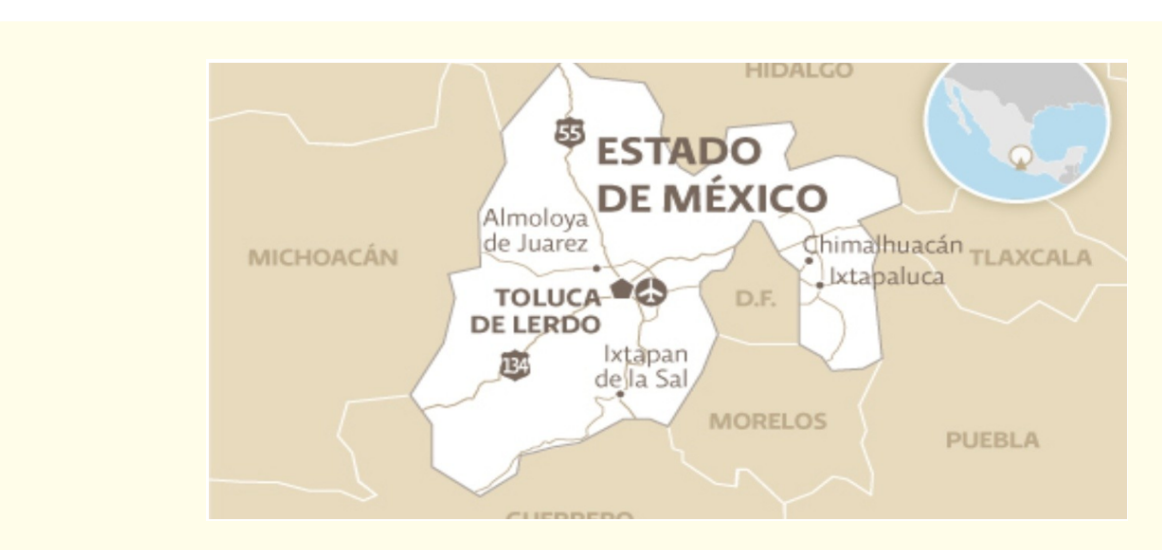
Figure 1: Huehuetoca, State of Mexico.

The setting in which the study was developed was the municipality of Huehuetoca, State of Mexico, located in the center of the country, bordering the states of Michoacán, Tlaxcala, Puebla, Morelos and Mexico City. 10,023 people live in the town, the houses reach 24,872, with an average size of four people. 4,582 families are managed by heads of families, the average schooling is 9.1 years and they have 108 middle and higher schools. 34.1 is in a social deprivation, 8.1 is vulnerable in terms of income, 21.4 is neither poor nor vulnerable, 30.7 is located in the moderate poverty line and 5.7 in extreme poverty (See figure 1).