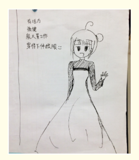
Future self in her expectation: Energetic, strong, can work a lot, can fit bridesmaid dress