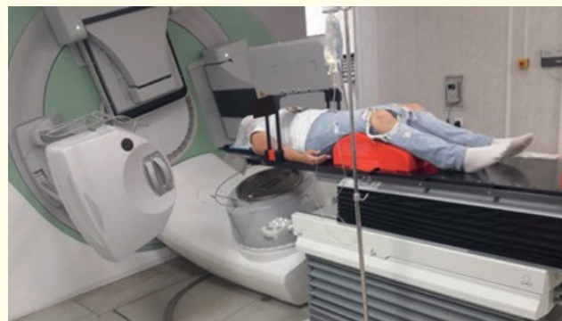
Figure 4: Patient A, 36 years old. Intravenous administration of valproic acid during a radiation therapy session.