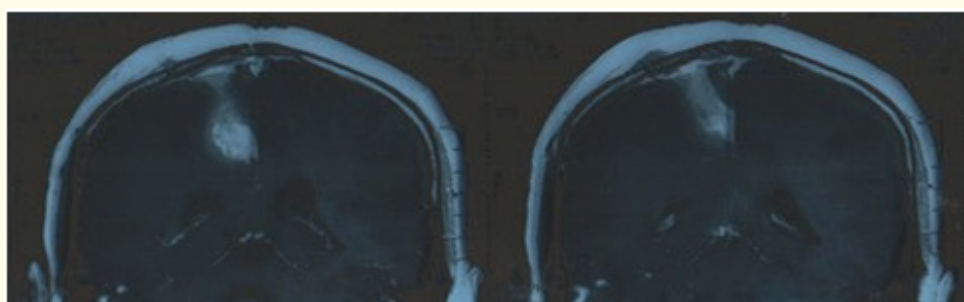
Figure 2: MRI scan of patient A, 36 years old. Tumour in the posterior parts of the right frontal lobe.

Brain MRI of the patient is presented in figure 2.