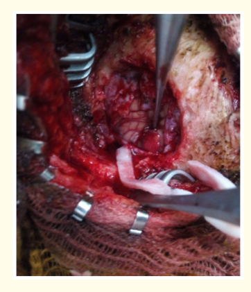
Figure 1: Intraoperative view of a left cerebellar hemangioblastoma after cyst collaps.

Biologically, we did not find polycythemia. In the absence of magnetic resonance imaging (MRI), we performed a CT scan that found in the posterior fossa, an expansive process of cystic nature with wall nodule enhanced intensively and early after injection of the product. Contrast in left lateral cerebellar evoking in the first place a hemangioblastoma. He was responsible for compression of the fourth ventricle with upstream ventricular tricephalic hydrocephalus (Figure 1). Thus, we retained the diagnosis of a hemangioblastoma in front of its clusters of clinical and paraclinical arguments.