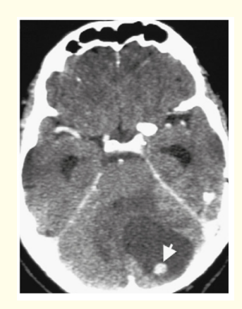
Figure 2: Expansive process of spontaneously hypodense tumoral appearance of cystic pace measuring 38 X 28 X 27 mm, associated with a strongly raised wall nodule after contrast product: hemangioblastoma.

Compared to the treatment, initially a ventriculo-peritoneal by a non-adjustable medium pressure valve (the only available on site) was practiced the same day. The postoperative course was marked by an improvement of the vigilance of the patient, against the cerebellar syndrome persisted. Subsequently, we performed a tumor resection nine days after ventriculo-peritonial shunt. This surgery was performed under general anesthesia in right lateral decubitus, under an operating microscope. After opening the dura mater, the arteries and draining veins were identified and the feeding artery was well defined and then coagulated. Bulk resection could be performed (Figure 2); this was facilitated by the drainage of the peri-tumoral cyst. The postoperative course was simple. Anatomopathological examination of the operative specimen confirmed the vascular nature and the benign nature of the tumor. The histological aspect was that of a hemangioblastoma (Figure 3).