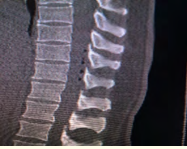
Figures 1-3: Neuro-axis tomography with the presence of air before therapeutic measures.