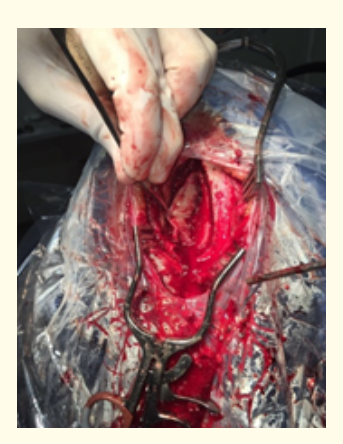
Figure 3: Intraoperative aspect of the subdural mass after the small craniotomy.

She underwent trephination surgery, with two holes to the right. In the intraoperative period, a mass was evidenced and biopsy material was collected (Figure 3). A small craniotomy was performed to amplify the surgical field.