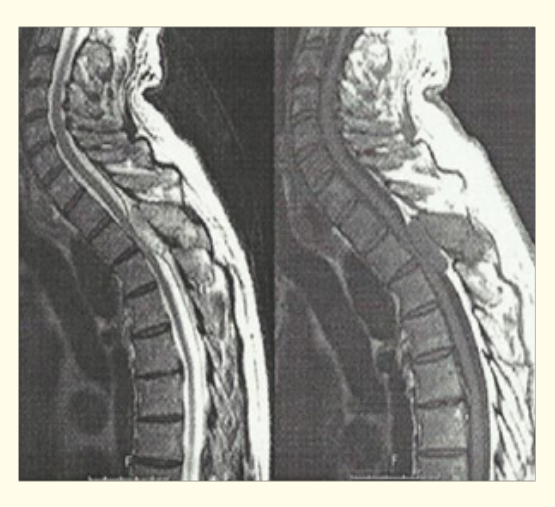
Figure 1: MRI T2 and T1 weighted sagital sequences of the thoracic spine demonstrating a posterior extradural sausage-shaped soft tissue mass, elevating the dura and compressing the spinal cord against the posterior vertebral bodies.

This is a Case Report of a 71 year old man with an eight month history of right lower limb numbness, cramps and progressive weakness gradually worsening and eventually involving both legs. Radiological investigations demonstrated a T2-T3 intraspinal extradural lesion which appearances initially seemed to indicate a possible diagnosis of Plasmacytoma. Subsequent total surgical resection was successful, and histological evaluation revealed the presence of a Myxopapillary Ependymoma.