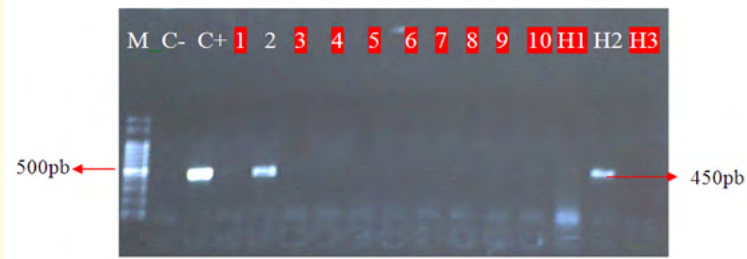
Figure 2: Representative gel of the amplification of a 450pb fragment containing the L1 gene of HPV.

Penile lesions samples which does not present the corresponding band of LCR of HPV-16; H9: bands related to the amplification of 1000pb fragment of HPV-16 LCR; the results were visualized on 1% agarose gel after electrophoretic run at 100V.