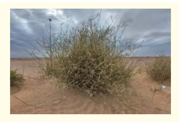
Figure 1: Desert grass Panicum turgidum (local name Thummam) [21].

So the aim of this study is to investigate the phytochemical and antimicrobial activity of, Panicum turgidum aqueous extract as a grazing herb against some medically important animal pathogens ( Staphylococcus epidermis, Escherichia coli, Streptococcus pyogens, Pseudo monasaerogenes, Salmonella typhimurium, Enterococcus, Bacillus cereus, Klebsiella pneumoniae and Candida albicans ) by agar well diffusion method.