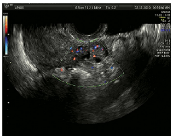
Figure 1: Ultrasound and peripheral vascularization.

increased prevalence of sexually transmitted infections and the use of assisted reproductive technique (ART). However, ectopic pregnancy in the remnant tube after ipsilateral salpingectomy is rare and usually associated with reproductive techniques, being less likely to occur after natural conception. The unique anatomic location of the tubal stump pregnancy sometimes results in delayed diagnosis. Transvaginal ultrasound is the only method which help to diagnosed this problem (Figure 1). The risk of rupture of the uterus tends to increase beyond 12 weeks of amenorrhea and the rupture of the ectopic part occurs in 20% of ectopic pregnancies beyond 12 weeks of gestational age [3]. Developing better methods for earlier diagnosis would decrease morbidity and increase the chance of successful laparoscopic surgery.