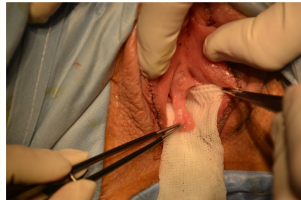
Figure 2: Procedure.

Surgery total surgical time was 80 minutes with no complications.