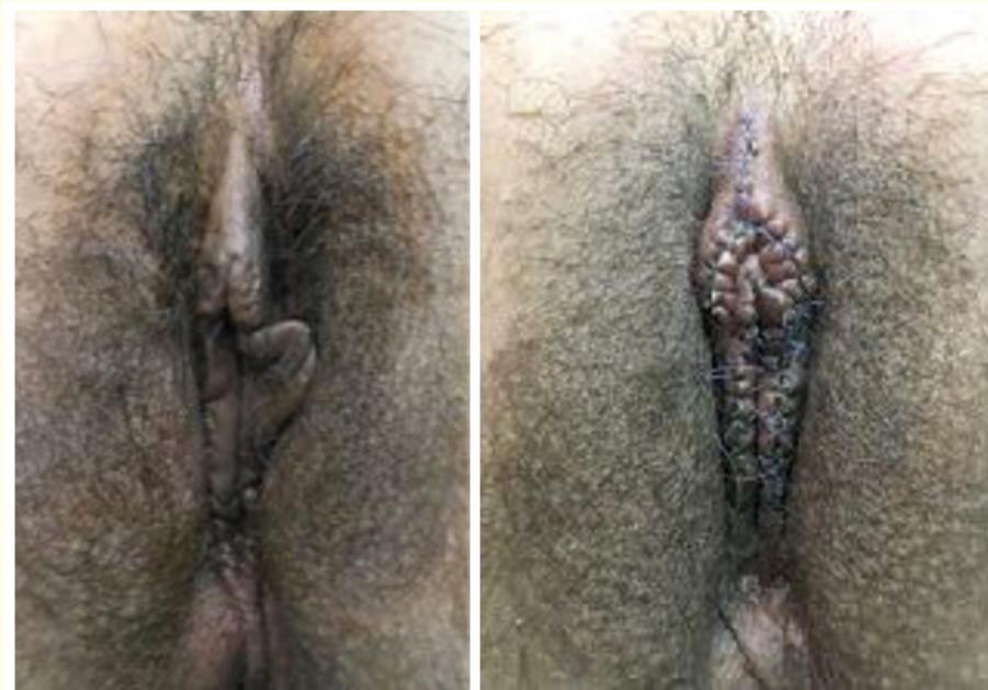
F G Figure 3: Image F Presurgical, Image G immediate postsurgical.