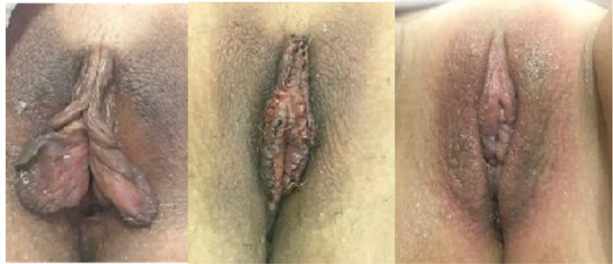
C D E Figure 2: Image Presurgical C, D postsurgical immediately, image E postsurgical one month.