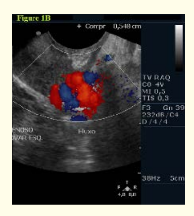
Figure 1B: Ultrasound confirms varicose veins beside the ovaries through the scale of colors.