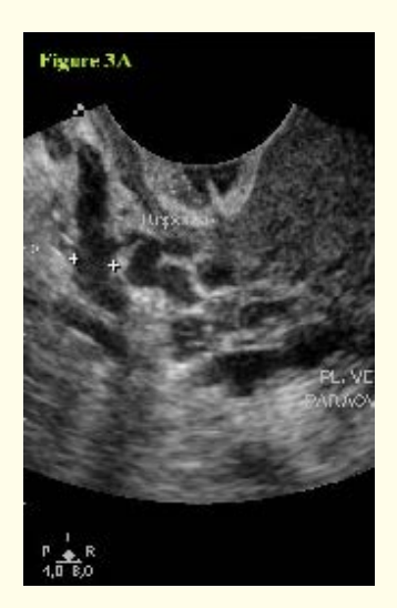
Figure 3A: Ultrasound highlights varicose veins in the broad ligament of the uterus - mode B.

35 year old woman, with premature ovarian failure, confirmed by exams FSH = 114.0 mUI/ml, LH = 61.8 mUI/ml laboratory, was submitted to treatment with the hormone progesterone and became pregnant after 1 month of treatment. On the 1<sup>st</sup> of June 2013, six months into her pregnancy, she began having disabling pain in the supra public region. The delivery of the child was through a caesarean operation. The baby born was female. Six months after the gestation, an ultrasound of ovarian veins was carried out, which confirmed varicose veins in both ovarian plexus (Right = 5.0 mm) (Left = 3.0 mm), with reflux on the right ovarian plexus confirmed by the doppler as shown in Figures 3A and 3B.