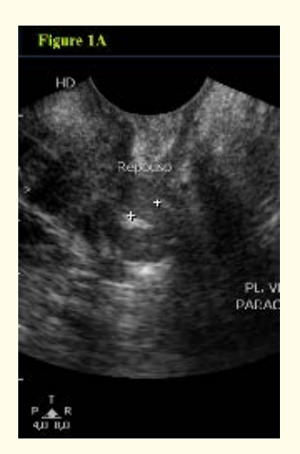
Figure 1A: Ultrasound highlights varicose veins in the broad ligament of the uterus - mode B.