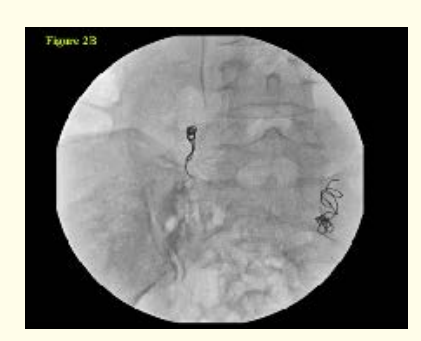
Figure 2B: Embolization of pelvic varicose veins with metallic coil and 1% polidocanol.

After this treatment, the patient reported an improvement in her menstrual flow that used to last for 8 to 10 days, with dark coloring and with disabling menstrual cramps. Now, it lasts only around 3 days, with brighter and red coloring and with no menstrual cramps. Also, she no longer had intestinal constipation.