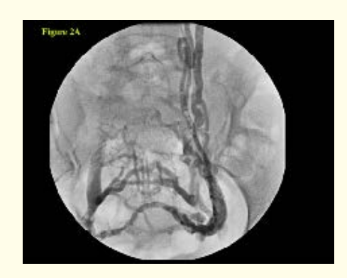
Figure 2A: Ovarian Varicose veins confirmed by Pelvic Phlebography.

Citation: Kennedy Gonçalves Pacheco and Raquel Fortes. "Ovarian Varicose Veins may Provoke Premature Ovarian Failure?" EC Gynaecology 2.2 (2015): 156-162.