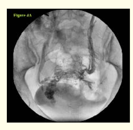
Figure 4A: Ovarian Varicose veins confirmed by Pelvic Phlebography.