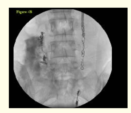
Figure 4B: Embolization of pelvic varicose veins with metallic coil and 1% polidocanol.

Citation: Kennedy Gonçalves Pacheco and Raquel Fortes. "Ovarian Varicose Veins may Provoke Premature Ovarian Failure?" EC Gynaecology 2.2 (2015): 156-162.