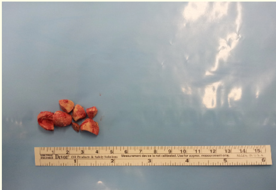
Figure 3: The stone, 29 grams in weight.