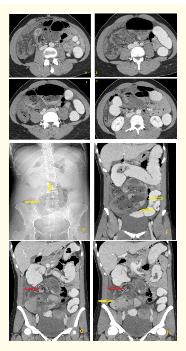
Figure 1: The axial CT scan (A-D), scout view (E), coronal CT (F-H) showing a dilated cecum (yellow arrows), with peaking and swirling of mesenteric vessels (red arrows) at its transition to a collapsed colon.

A CT abdomen and pelvis was done and showed hugely dilated cecum with abnormal site and orientation with cluster of collapsed ileal loops in abnormal location at the right paracolic gutter associated with engorgement of mesenteric vessels and free fluid. A characteristic whirl sing of the cecal mesentery indicating cecal volvulus was seen (Figure 1).