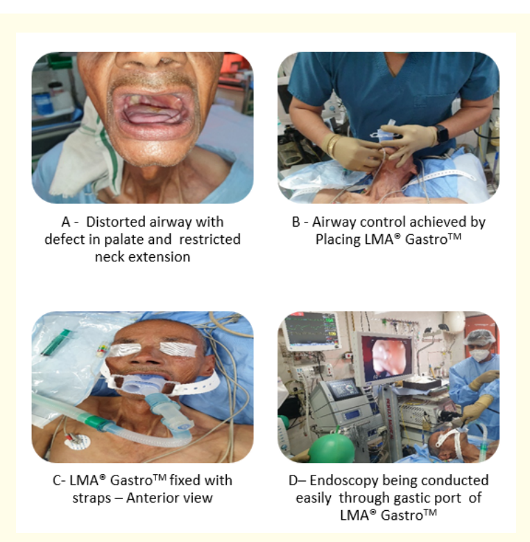
Figure 1: Placement of Gastro LMA & conduct of procedure