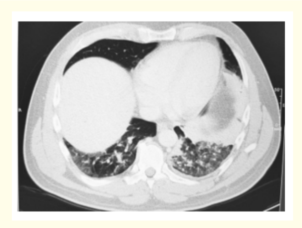
Figure 1: Initial CT abdomen.

creatic lodge were seen. Laboratory tests showed increased inflammation values: white blood cell count 23,300 G/l and a CRP 80 mg/dl. Electrolytes, liver values, pancreatic enzymes, LDH, and creatinine were normal. The urine sediment was positive for blood. The POCT PCR test on admission showed evidence of an active Covid-19 infection. A "stone" CT of the abdomen was performed on suspicion of a renal colic with possible renal pelvic inflammation.