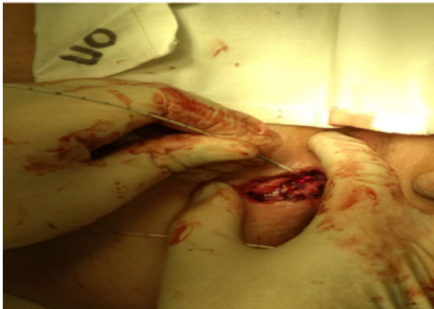
Figure 2: Fistula destruction using a radial laser light guide.