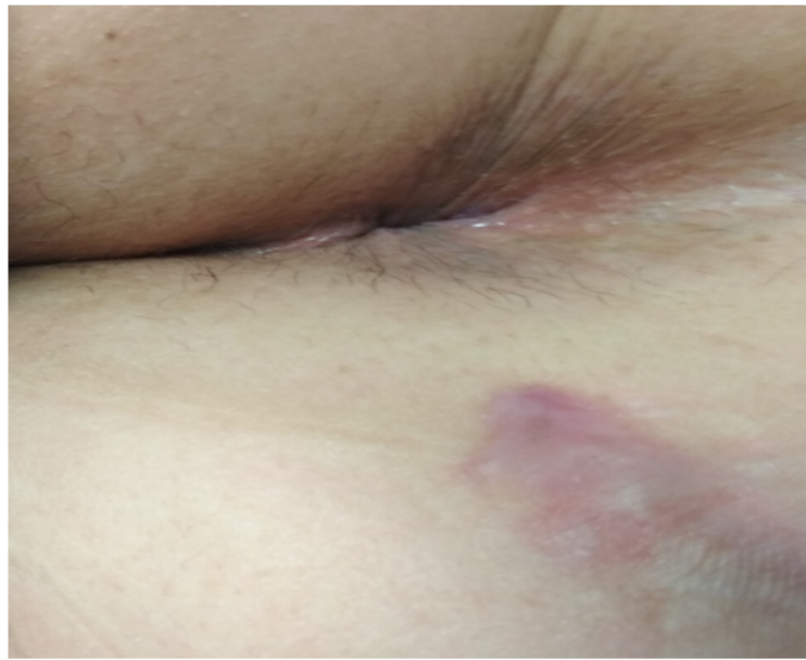
Figure 3: The result of laser-based destruction of the perianal fistula 15 days after the procedure.

On average, the surgical procedure lasted 17.7 \pm 4.5 minutes ( M \pm \sigma ). The average hospital stay length was 6.5 \pm 2.7 days ( M \pm \sigma ). In the early postoperative period, anesthesia was managed with non-narcotic analgesics (Ketanov 1.0 v/m for pain relief); no narcotic analgesics were required. No complications were observed in the early postoperative period. The wounds were closed within 15 \pm 2.3 days (Figure 3).