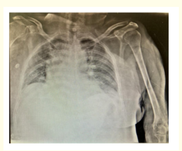
Figure 4: Chest x-ray on the 2nd postoperative day, with an increase in the vascular pattern and bilateral perihilar infiltrates. The patient already has a COVID-19 diagnosis.

After the surgery, she had a torpid evolution, with a fever of 38^{\circ} C, as well as dyspnea on small and medium exertion, saturation up to 80% of room air, tachycardia, oliguria, a new control chest x-ray was taken, which shows a generalized opacity in both pulmonary fields, as well as an increase in the bronchoalveolar weft (Figure 4). In this situation, the TRMC-19 Questionnaire is performed with a score of 48 points, being classified as high risk; then the polymerase chain reaction test of reverse transcriptase (RT-PCR) is taken, and it is positive, for which the diagnosis of SARS-Cov 2 (COVID-19) was confirmed. Patient shows significant deterioration in respiratory and metabolic function, and blood gas test is taken which reports the following pH: 7.22, pCO<sub>2</sub> 20mmHg, pO<sub>2</sub> 105 mmHg, HCO<sub>3</sub> 8.2 mmol/L, BE -19.5 mmol/L, SO<sub>2</sub> 85%, death took place on November 18.