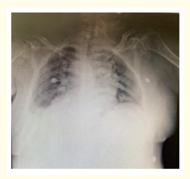
Figure 1: Chest X-ray upon admission to the emergency department, where a discrete widening of the mediastinum, and bilateral perihilar infiltrate are observed, as well as a slight recess of the costodiaphragmatic sinuses.

Chest X-ray: An increased bronchoalveolar structure is observed, with flow cephalization, as well as bilateral perihilar infiltrates (Figure 1).