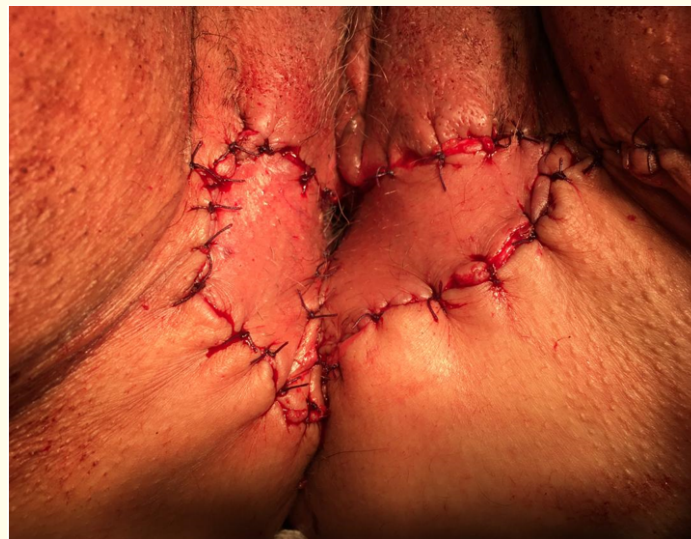
Figure 3: Surgical approach. Note the bilateral V-shaped skin flaps.

Bilateral V skin flaps and vaginal plasty were necessary (Figure 3).