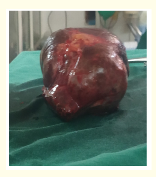
Figure 2: Operative specimen.