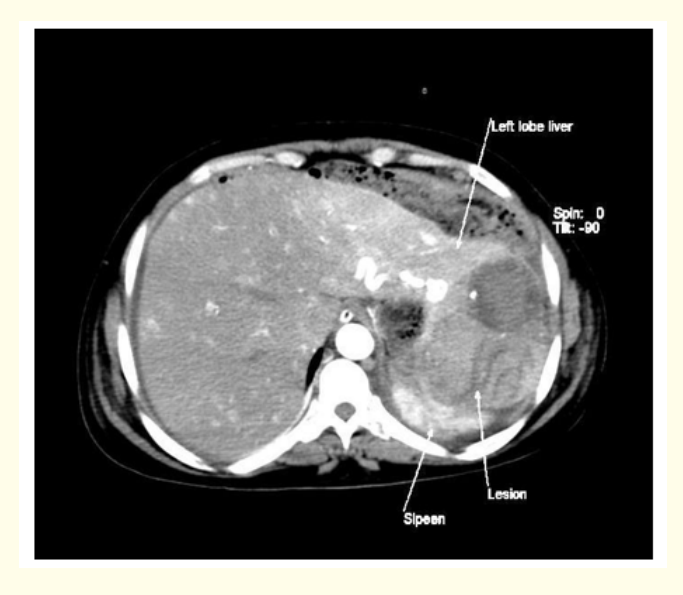
Figure 1: CT scan image of hemangioma.

HHs are congenital vascular malformations, composed of masses of blood vessels and blood filled cavities, surrounded by walls lined by single vascular endothelium. Size of hemangioma can vary from few mm to 20 cm [3]. HH as large as 40 cm has been reported [4]. They