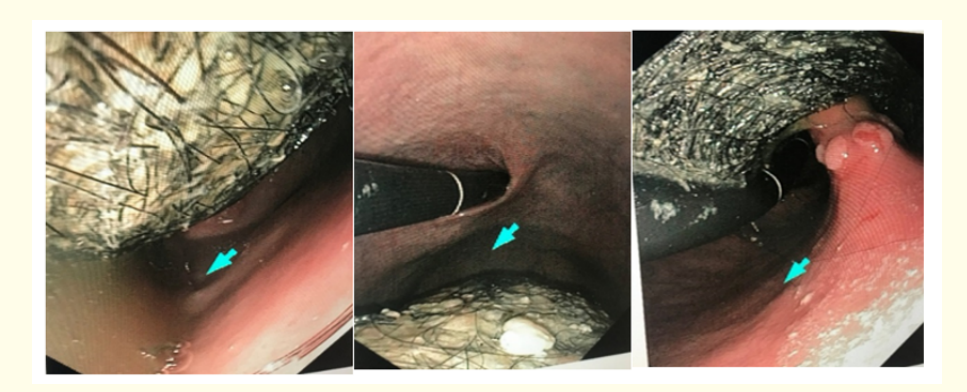
Figure 2: Data from the patient's medical history. General Surgery Service of "Hospital General Ambato.