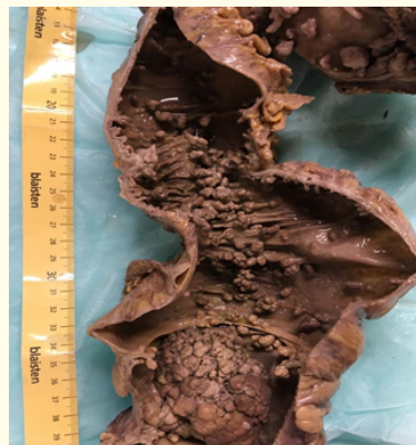
Figure 4: Specimen fixed with formalin. Multiple isolated and confluent polyps with normal mucosa areas.

The histopathology reported more than 100 polyps covering the colon and rectum and three synchronous adenocarcinomas, in the cecum, rectosigmoid junction and mid rectum. Ninety-three lymph nodes were isolated and four had metastatic disease. Stage pT3 pN2a (Figure 4 and 5).