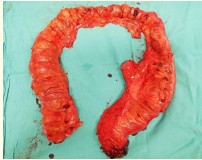
Figure 1: Total proctocolectomy specimen.

Patient was placed in a modified Lloyd Davies position following general anesthesia. The procedure started with the abdominal part using five trocars. Complete colonic mobilization was performed and total mesorectal excision was continued, just as the transanal approach was beginning. An anal retractor was placed to achieve adequate view of the dentate line and just above it, the mucosa was replaced by polyps. Due to this finding, we decided to start with an intersphincteric dissection. Then we placed the transanal platform and advanced the dissection towards to cephalic, communicating both dissections. The complete surgical specimen was retrieved by transanal route (Figure 1). The standard stapled ileal J pouch was made (Figure 2) and handswen ileoanal anastomosis was performed. Drainage was placed in the pelvic and Brooke style ileostomy was performed (Figure 3). The total duration of the surgical procedure was approximately 280 minutes.