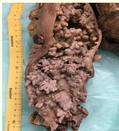
Figure 5: Specimen fixed with formalin. Large confluent polyps that completely replace normal mucosa.