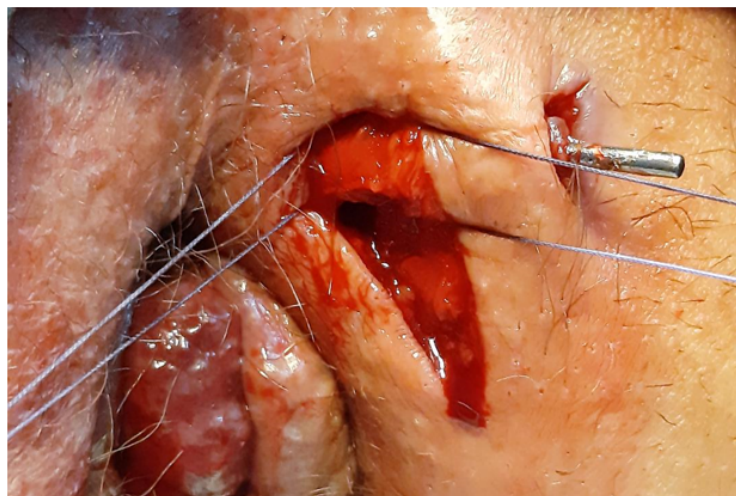
Figure 2: Marking of the intersphincteric fistulous path.