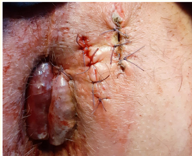
Figure 4: Closure of the skin incisions.