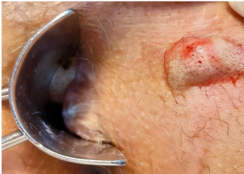
Figure 1: Individualization of the internal hole by using hydrogen peroxide.

day, ketorolac 30 mg EV every 6 hours, nalbuphine 1cc subcutaneous (SC) every 8 hours, cefalotin 1g EV every 8 hours (two doses). The sanitary discharge is granted the following day, after tolerating breakfast, indicating: ketorolac 20 mg orally (PO) every 6 hours - 5 days - tramadol 50 mg (PO) every 8 hours - 7 days - amoxicillin clavulonate 1 gram (PO) every 12 hours - 7 days; diet with high residue, warm sits baths with the addition of 10% iodopovidone to maintain the hygiene of the area and stimulate healing and postoperative control at 15 days and 30 days.