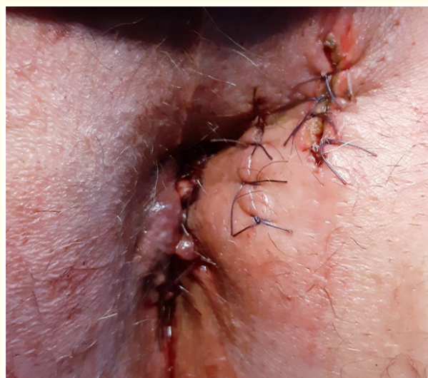
Figure 5: The LIFT Procedure was punctually completed in this case with a hemorrhoidectomy of the left hemi anus according to the Buie Technique.