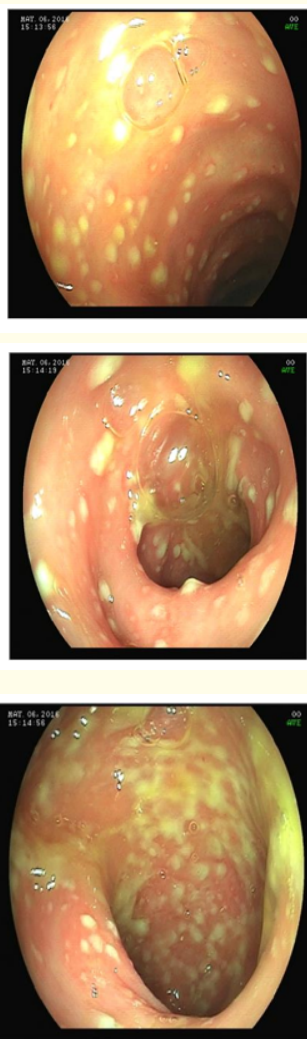
Figure 2: Challenges Scopiascopia - 13/04/2016.

He started treatment with Metronidazole 400mg of 8/8 hours, associated with Vancomycin 500 mg of 6/6 hours, both orally, presenting favorable evolution both clinical and laboratory, between the first (Hbg: 10.6; Ht: 31.5; Leucocytes: 32,300; Bats: 18%) and the second day of hospitalization (Hbg: 10.7; Ht: 31.8; Leukocytes: 10000; Bats: 2%); as well as improvement in the inflammatory pattern of the sigmoid mucosa on rectosigmoidoscopy after seven days.