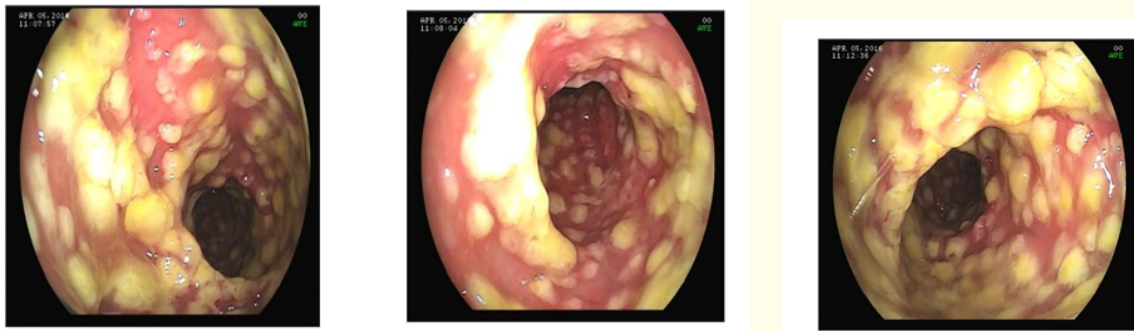
Figure 1: Challenge sigmoidoscopy - 05/04/2016.

He started treatment with Metronidazole 400mg of 8/8 hours, associated with Vancomycin 500 mg of 6/6 hours, both orally, presenting favorable evolution both clinical and laboratory, between the first (Hbg: 10.6; Ht: 31.5; Leucocytes: 32,300; Bats: 18%) and the second day of hospitalization (Hbg: 10.7; Ht: 31.8; Leukocytes: 10000; Bats: 2%); as well as improvement in the inflammatory pattern of the sigmoid mucosa on rectosigmoidoscopy after seven days.