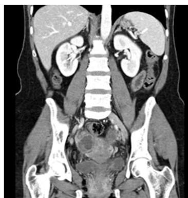
Figure 1: Abdominal CT scan - organized and heterogeneous peritoneal fluid in the pelvic cavity and a thickened appendix (14 mm) associated with fluid collection..

We present a 47-year-old female patient with history of chronic Gastritis, Depressive and Anxiety disorder, who was admitted to the emergency department due to abdominal pain with 4 days of evolution, initially diffuse, with later migration to the right iliac fossa. On admission, the patient was febrile, hemodynamically stable, with pain and tenderness on palpation of the right iliac fossa and signs of peritoneal irritation. Blood work showed high inflammatory parameters. An abdominal ultrasound was performed, showing free fluid in the peritoneal recesses, relatively heterogeneous, especially in the pelvic cavity.