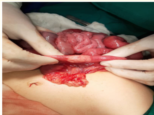
Figure 2: Photograph of the yellowish mass measuring 1.5 cm located at the antimesenteric wall of the jejunum.

The patient underwent to exploratory laparotomy. laparotomy revealed a yellowish mass measuring 1.5 cm located at the antimesenteric wall of the jejunum, about 15 cm from the ligament of treitz (Figure 2). The mass was resected, eventually an end-to-end anastomosis was performed. Postoperative course was uneventful; histopathologic examination of the resected specimen revealed ectopic pancreatic tissue consisting of acini, islet cells, and pancreatic ducts located in the sub-mucosal layer and extend to the muscular layer with obvious border (Figure 3).