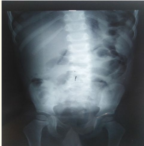
Figure 1: Abdominal X Ray show abnormal gas distribution and intestinal dilation.

The laboratory tests showed elevated white blood cells (WBC = 20000, N = 76%), Hemoglobin was 11g/dl, elevated CRP (CRP: 27, normal up to 5) Other blood tests including ESR,GPT, Wright, Widal, Amylase and Lipase were normal. Occult Blood in stool was Positive. Urinalysis was normal. The radiographic investigation showed: Abdominal X Ray was unremarkable and showed abnormal gases distribution in the abdomen (Figure 1). Abdominal ultrasonography and Contrast-enhanced computed tomography of the abdomen were performed, the imaging findings included thickening of the involved bowel wall and surrounding inflammation, inflammatory nodes and suspected ileoileal intussusception was found in the right lower abdomen with a diameter of 2.5 cm.