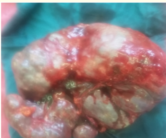
Figure 2: Spleen of diffuse cystic lymphangiomas specimen after splenectomy.