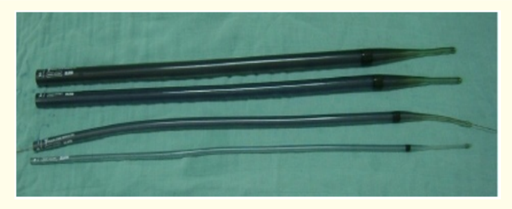
Figure 1: Savary-Gilliard Bougies.