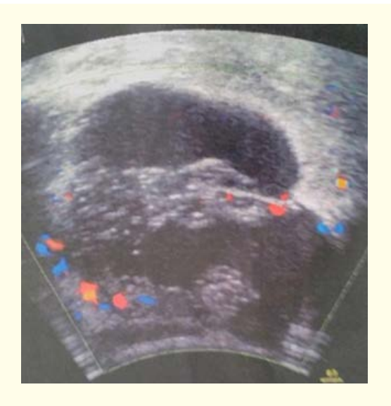
Figure 1: Lipomas lobulated on left flank.

The piece is removed and sent to the pathology service. Previous ultrasound had reported: lobulated lipomas on the left flank of 8 cm. New ultrasound reported lobulated cystic lesion at L2-L3 level with irregular septa and reinforcement nodules of 7.2 x 7.8. X 7.6 cm (Figure 1, 2).