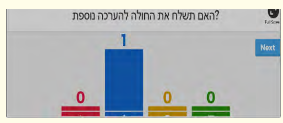
Figure 2: An example of a kahoot summative evaluation after all subjects have answered.