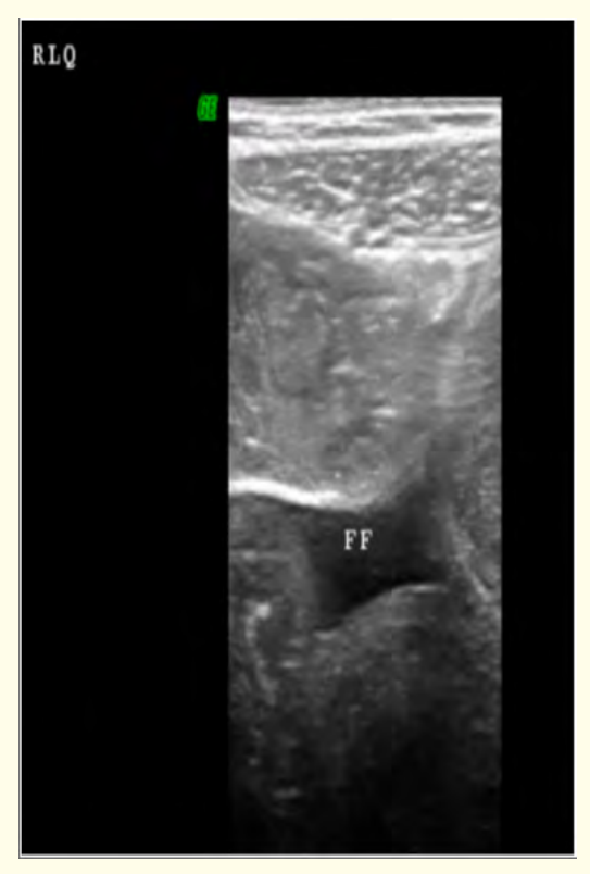
Figure 3: Vaginal US.