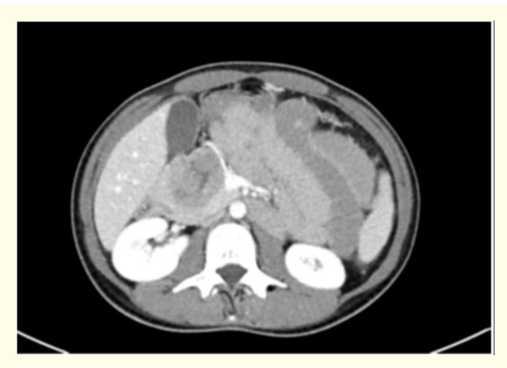
Figure 6: Abdominal CT.

Due to the findings in the US she was sent to an IV and PO contrast CT (Figure 6). In the formal interpretation the radiologist reported a lesion in RUQ, near the head of the pancreas there's a space-occupying lesion, with a hypodense center that is causing a spread in nearby blood vessels. On later scans the enhancement is not unified, with the center of the lesion staying hypo dense - Necrosis. The papilla is being moved backwards, with no CBD distension. In the distal ileum there is a short stricture and proximal to it there is bowel distension. Large bowel was collapsed. A small fluid collection in the pelvis. No other findings.