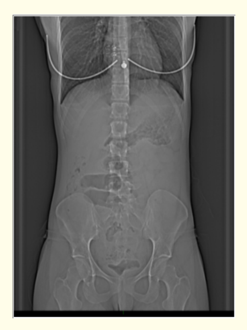
Figure 4: Abdominal X-ray.