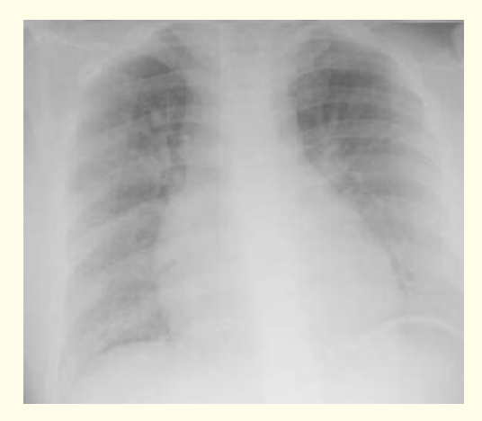
Figure 2: Chest X-Ray showing pulmonary edema.