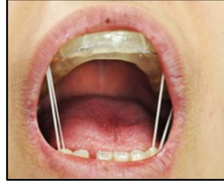
Figure 4: A. Maxillary splint with active screws B. Active muscle opening exercises.