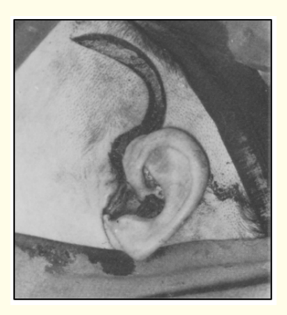
Figure 1: The incision in a question mark shape [7].

Surgical techniques can either be via a preauricular approach where assess to the condylar head and neck is achieved by an incision made through the preauricular skin crease. A modification of the preauricular approach begins about a pinna's length away from the ear, anterosuperior just within the hairline, and curves backward and downwards well posterior of the main branches of the temporal vessels till it meets the upper attachment of the ear [7].