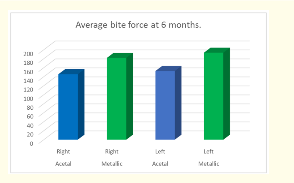
Figure 4: Average bite force at six months.