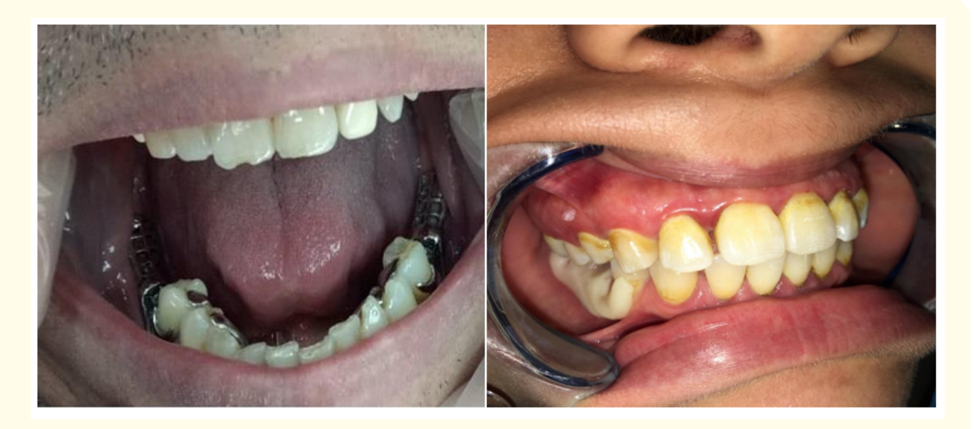
Figure 1: A) Metal framework, B) Acetal resin framework.

The exclusion criteria include: Patients with history of drug therapy, which interferes with bone resorption, abnormal jaw relationship, patients with parafunctional habits, inadequate inter arch space.