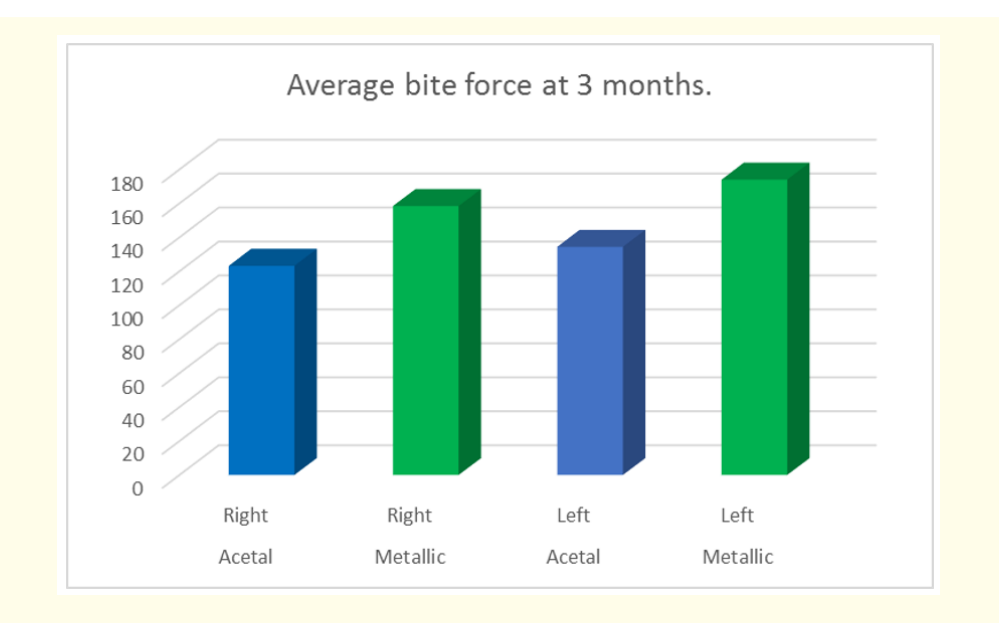
Figure 3: Average bite force at three months.

Citation: Kassem M., et al. "Bite Force Evaluation of Acetal Resin Denture Base in Kennedy Class I Partially Edentulous Patients". EC Dental Science 19.1 (2020): 01-08.